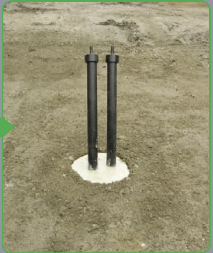
■ Completed geo loop installation.