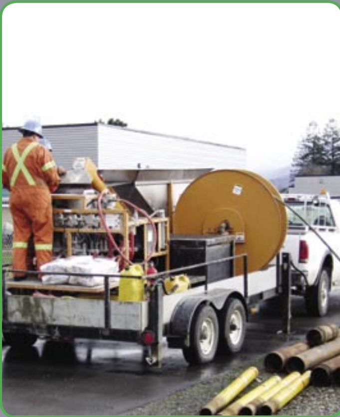
■ Grouting of geo loop.