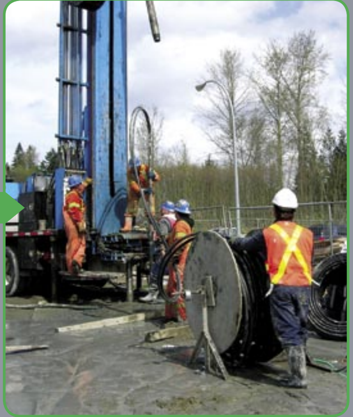
■ Lowering of geo loop.