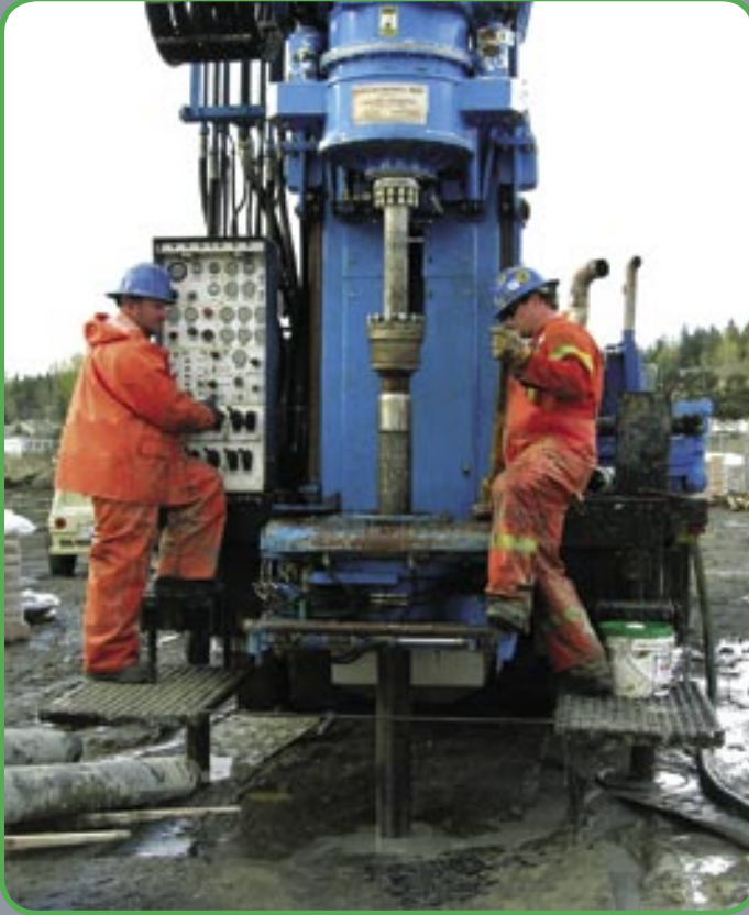
■ Drilling in progress.