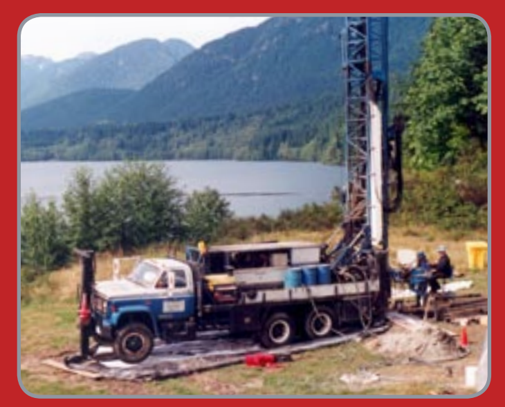
Installing piezometers to monitor seepage from a drinking water reservoir.