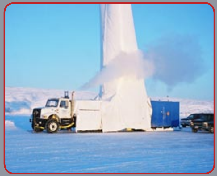
Drilling for the placement of seismic explosives for oil and gas exploration.

Angle drilling for the installation of cathodic protection anodes under a liquid natural gas steel storage tank.