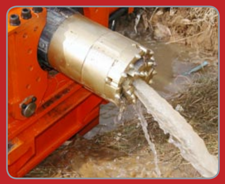
Typical sonic drill bit.