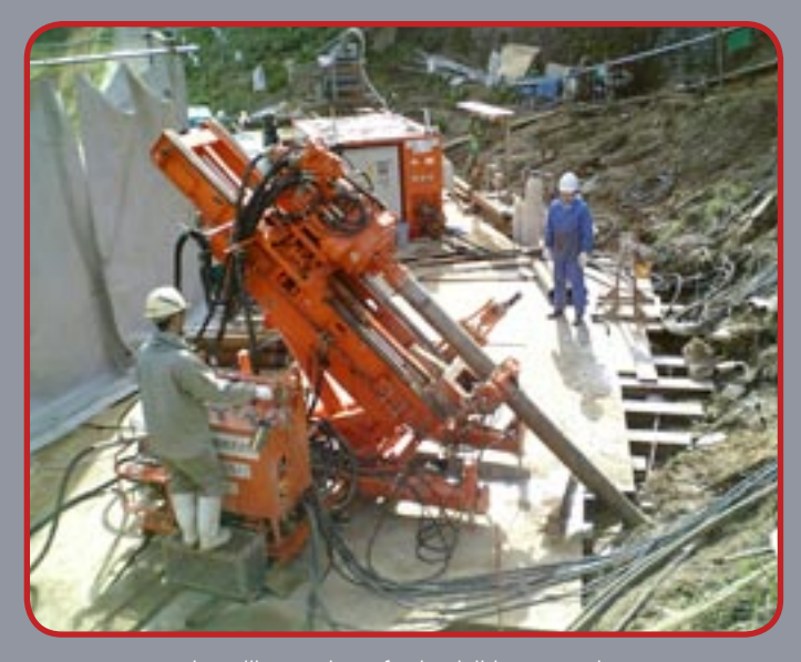
Installing anchors for landslide prevention.