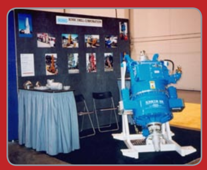
The modern sonic drill head can handle a variety of drilling applications.