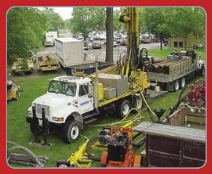
Preparation for large diameter multi-cased deep environmental exploration in artesian conditions.