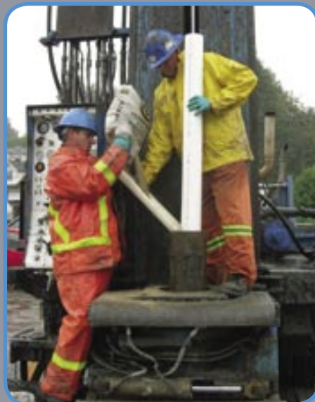
■ Pouring filter sand through temporary sonic outer steel casing.