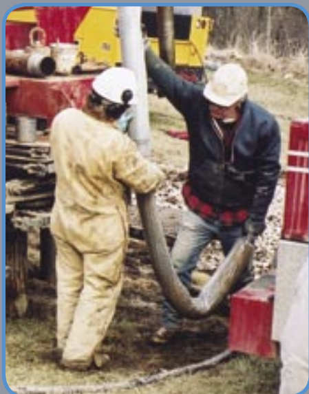
■ Extruding core sample using vibratory action.