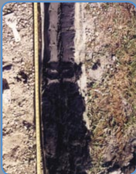
■ Continuous core sample showing interface between sand aquifer and confining clay layer.