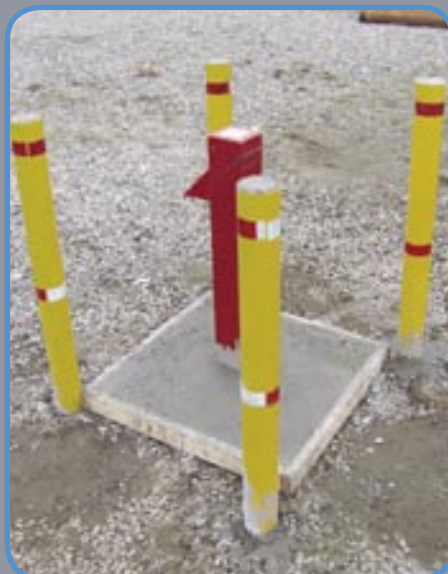
■ Finished observation well.