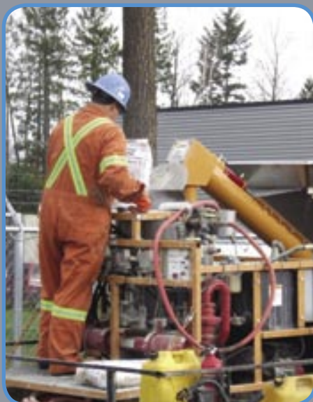
■ Grouting of bore hole.