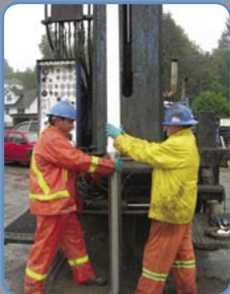
■ Installing stainless steel well screen with PVC riser pipe.