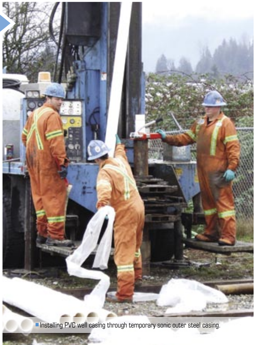
■ Installing PVC well casing through temporary sonic outer steel casing.