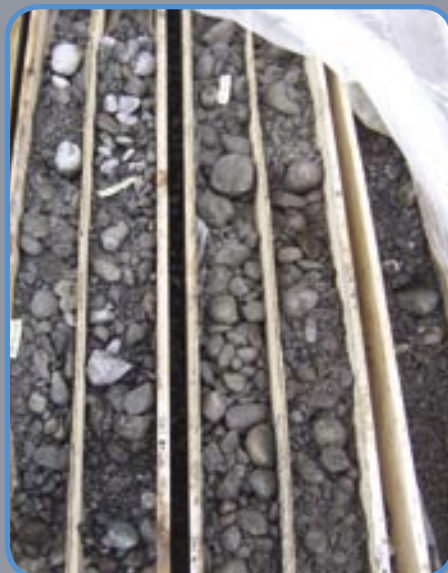
■ Core samples of gravel aquifer in core boxes ready for storage.