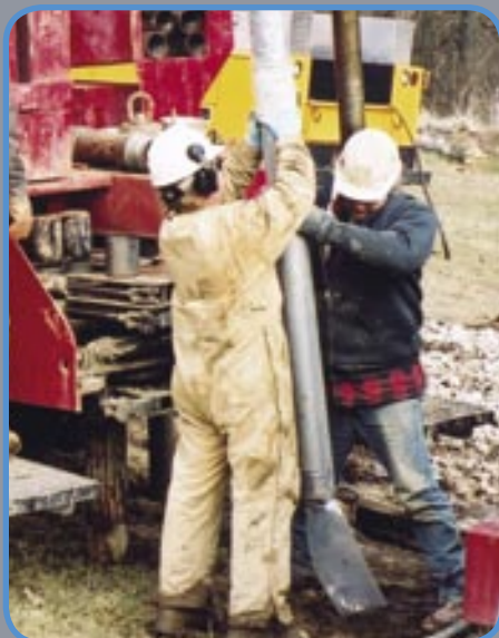
■ Installing poly core bag over core barrel prior to core extraction.